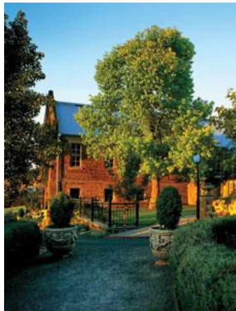
Goonawarra Winery today.

The Goonawarra Housing Estate as we know it today was developed in the 1980's. The shopping complex was built in 1982. The medical centre and pharmacy commenced on the current site in 1987. The school and the preschool centre also commenced in 1987 and the Goonawarra Neighbourhood House was opened in 1990.