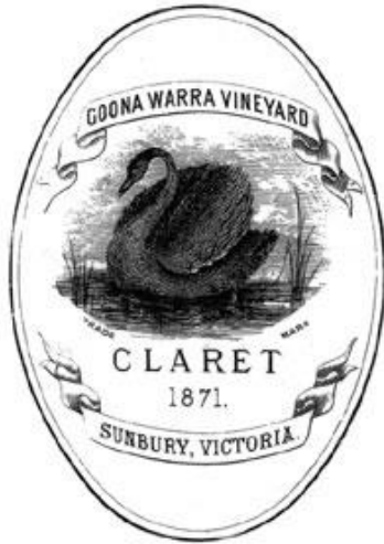
An early "Goonawarra Vineyard" label from 1871