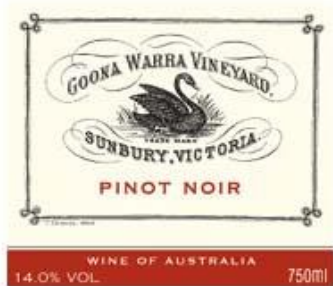
The label that is used today.